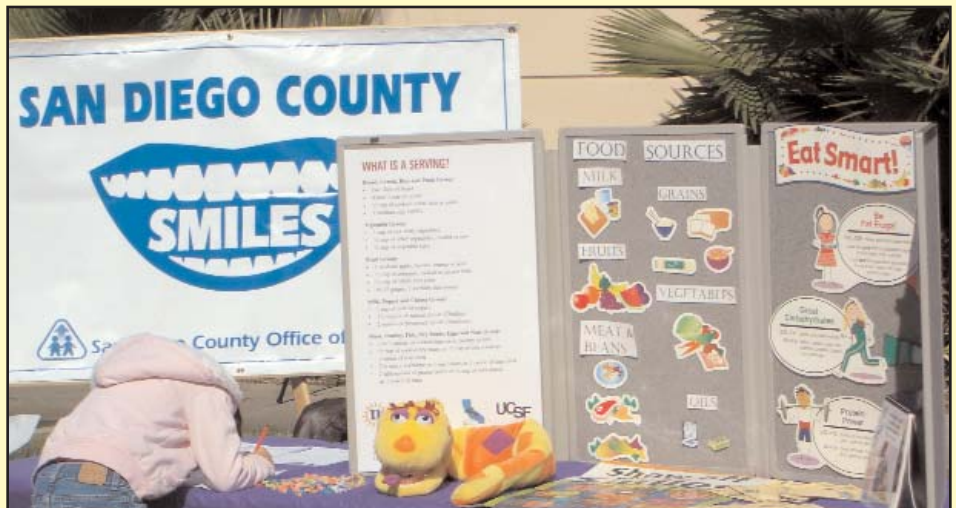
The Smiles Booth offers information at North Region's free dental clinic.