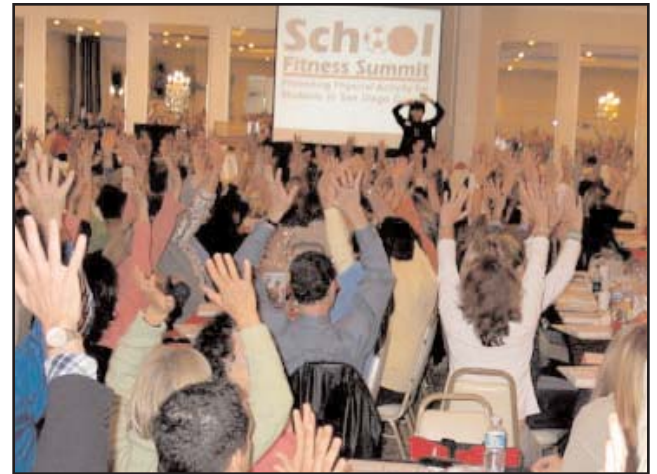
The School Fitness Summit even included physical activity for the audience.