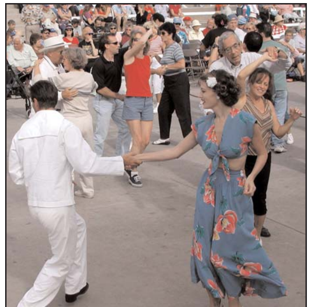
Don't miss out on the fun - the Annual Big Band Concert and Dance is good for everyone!

Groups of ten or more will have reserved seating. For more information, call the Big Band Info line at (760) 716-4824 or visit www.straightfromtheheartinc.com .