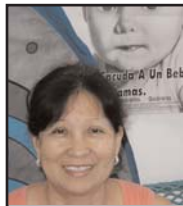
Lozares gives kids the best gift - caring.

To contact Lozares about donations (year 'round!) call (619) 341-1153.