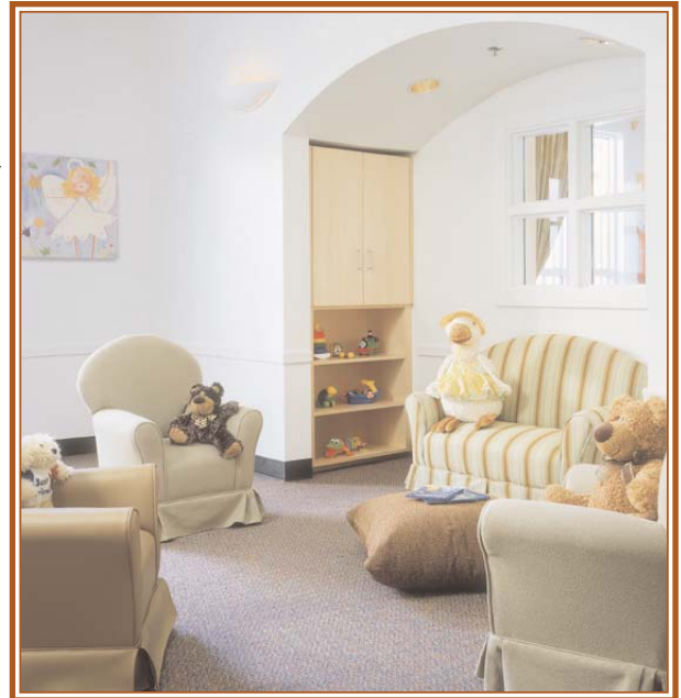
Serenity Cottage, Polinsky's new nursery, offers a peaceful haven for unsettled youngsters.

Construction began in January 2004 and was coordinated by the County's Department of General Services. The County operates the Polinsky Children's Center to provide emergency shelter care for abused, neglected and abandoned children.