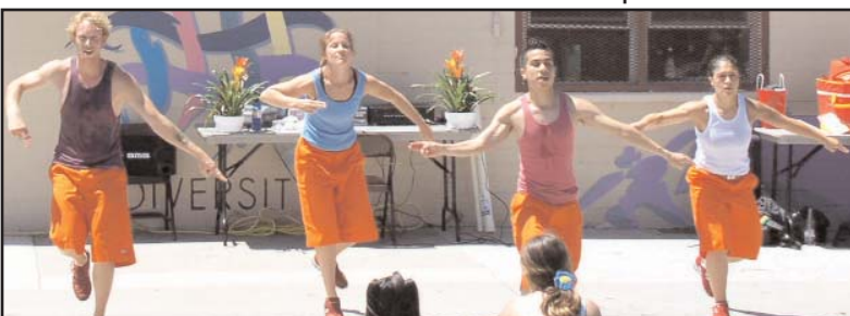
The Eveoke Dance Group provided entertainment at the North Central picnic by performing a variety of hip-hop dances and teaching the audience a few steps of their own.