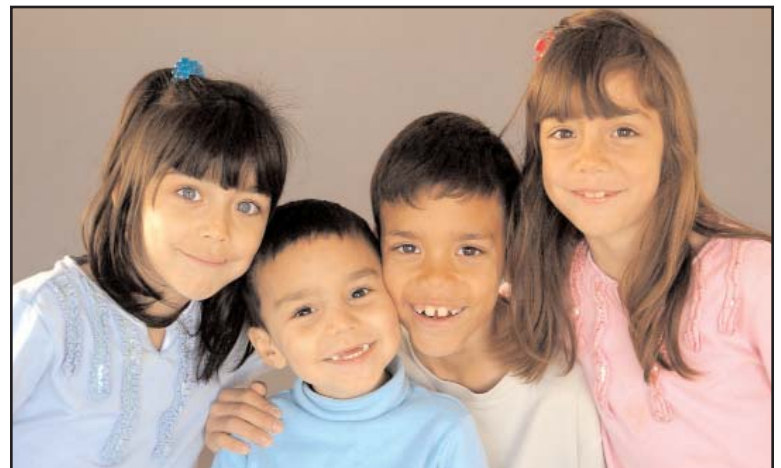
Children shown here are from the Heart Gallery and Leap of Faith collections.