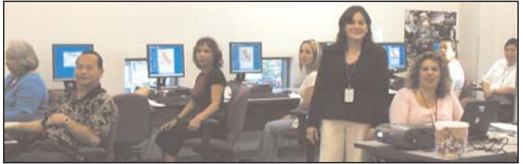
South Region staff gear up for new technology.

C alWIN is the largest automation endeavor the Agency has ever made for a public assistance program. It will be a new way of conducting business, a new way of interacting with clients, workers and supervisors. South Region embraces this change wholeheartedly and looks forward to the challenge of transitioning staff to this new way of business. San Diego County is scheduled to "Go-Live on CalWIN" in June 2006.