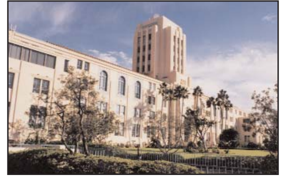
San Diego County's Administration Center

And, an organization chart shows the County's management structure, starting with the Board of Supervisors at the top.