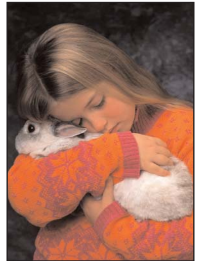
Domestic violence hurts witnesses, too.

For more information about the Raising the Bar initiative, contact the Office of Violence Prevention at (858) 581-5800.