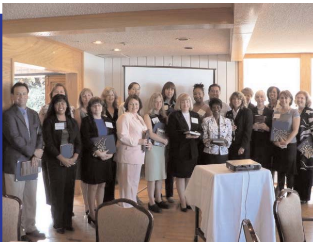
2006 Managers Development Institute graduates (top) and mentors (below).

Annual National Association of Counties Achievement Award and was one of only 14 "Best of Category" winners nationwide.