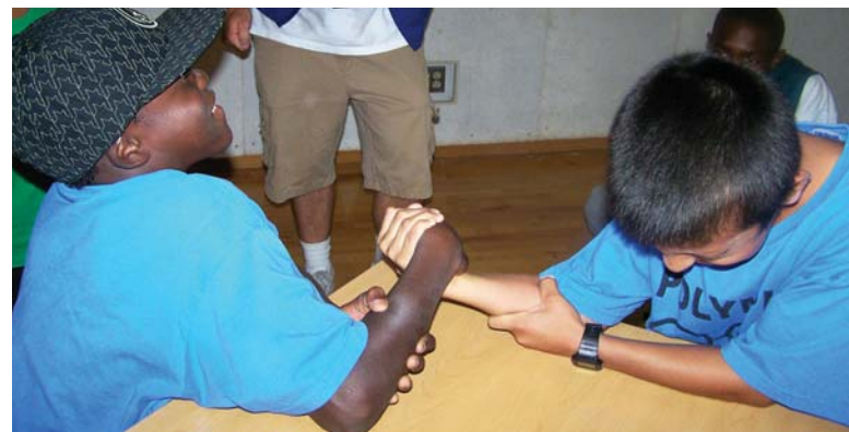
Two of the competitors in the second annual 'Polympics' battle for arm wrestling supremacy. The Polinsky Children's Center held the event to coincide with the Olympics in Beijing.

In honor of the games there were special evening meals throughout the week. During the closing ceremonies, every toddler and young child proudly received a medal with rib-