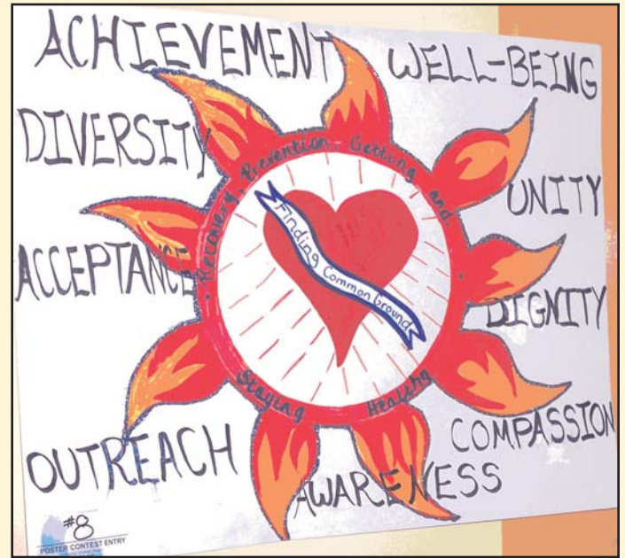
Poster contest entry highlights benefits of finding Common Ground.

The planning committee looks forward to finding more common ground at next year's workshop.