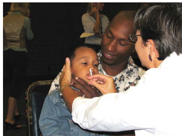
The East Region's Point of Dispensation drill was expanded to include children this year.

Nearly 500 East County residents took part in an HHSA Point of Dispensation (POD) drill on November 7. More than 90 Agency employees were trained to assume non-medical disaster worker roles. The event took place in El Cajon, as staff tested emergency preparedness plans in a situation that required County employees to provide vaccine or medicine in the event of a disease outbreak or bioterrorism event. The POD, conducted in collaboration with Public Health Services Immunization Branch, Emergency Medical Services and Public Health Nursing, provided free flu vaccines to the public and employees. In total, 460 individuals received the flu vaccine.