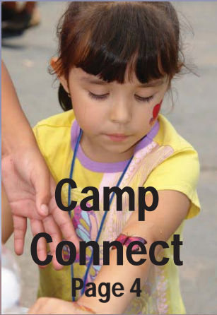
Camp Connect Page 4