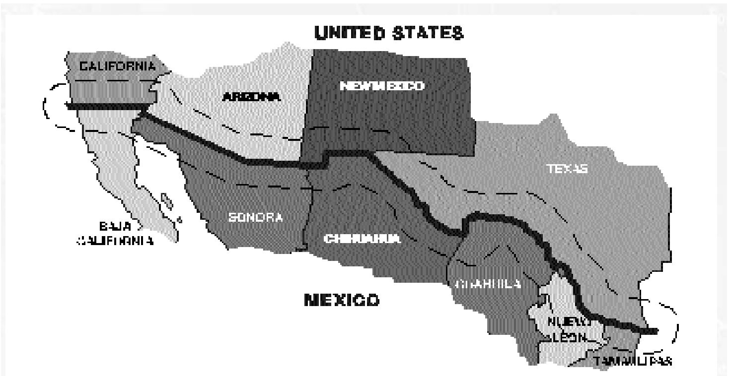
In 1983, the La Paz Agreement was signed, providing a formal foundation for cooperative environmental efforts. The agreement defined the border region as the area lying 100 kilometers, or 62.5 miles, to the north and south of the U.S.-Mexico boundary.

Chapter 2 presents an analysis of the advances made and challenges faced by the Border XXI Program as they are related to the fulfillment of the principal goal and strategies outlined in the Framework Document . Chapter 3 highlights the key accomplishments of the nine Border XXI workgroups since the program's inception. Using the commitments outlined in the Framework Document and the 1997 Indicators Report as a point of reference, the remaining chapters detail the principal issues, themes, objectives, achievements, and future perspectives of the Border XXI workgroups. Finally, in the addenda to this report, assessments and recommendations are presented by the U.S. and Mexican federal advisory committees for the border.